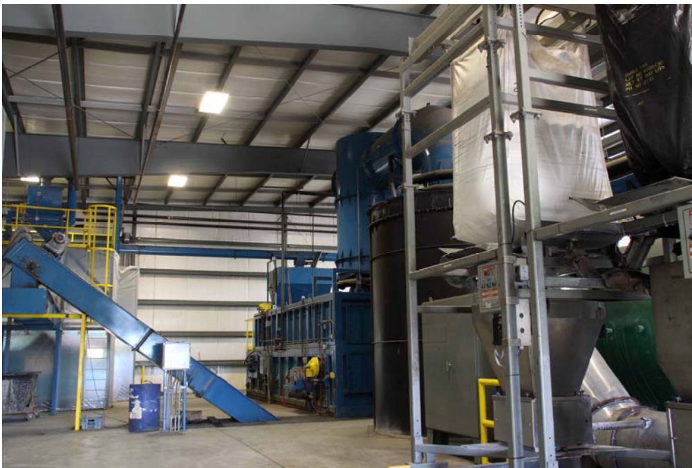
Figure 2 - Unit 1 of 2 with Lime/PAC Injectors