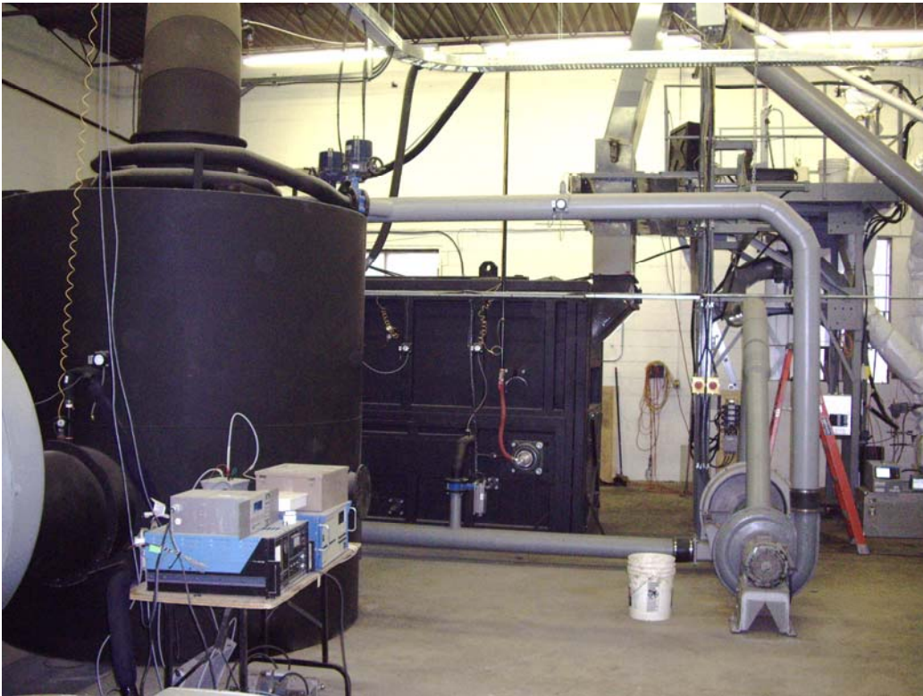
Figure 3 - REMASCO Prototype System