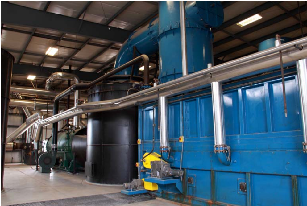
Figure 1- Unit 2 of 2 - with Steam Injection